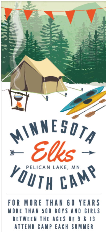
A new convention booth banner