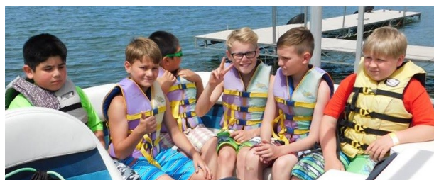
Time for a Pontoon ride